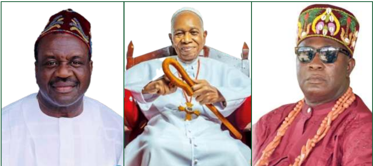
HE Obong Victor Attah Former Governor, AKS

P utting in place lasting institutions requires orderly transition of power for effective continuity. Without tangible continuity, plans derail, structures collapse, designs are eroded, visions are in shambles and projects are abandoned.